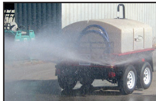
Rear spray bar is capable of producing a cone of water from 8' (gravity flow) to 36' (pressurized flow)